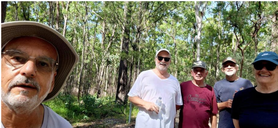
Looking for the two missing walkers