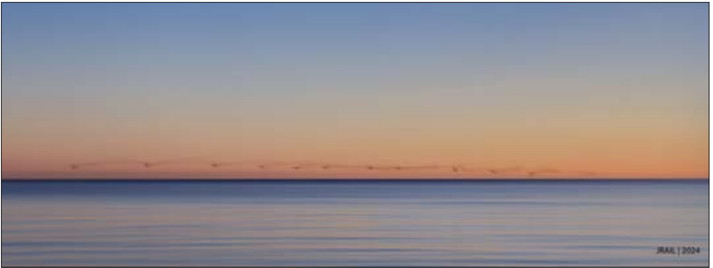
Flying Home During Winter Sunset