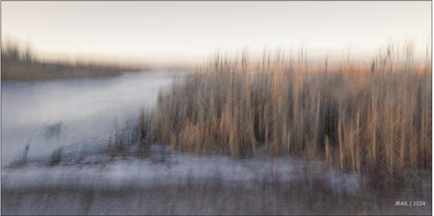
Winter Sunset in the Marsh