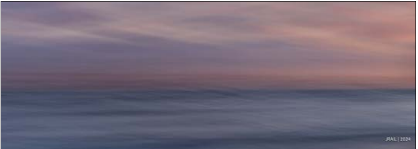
Pastel Winter Sunset