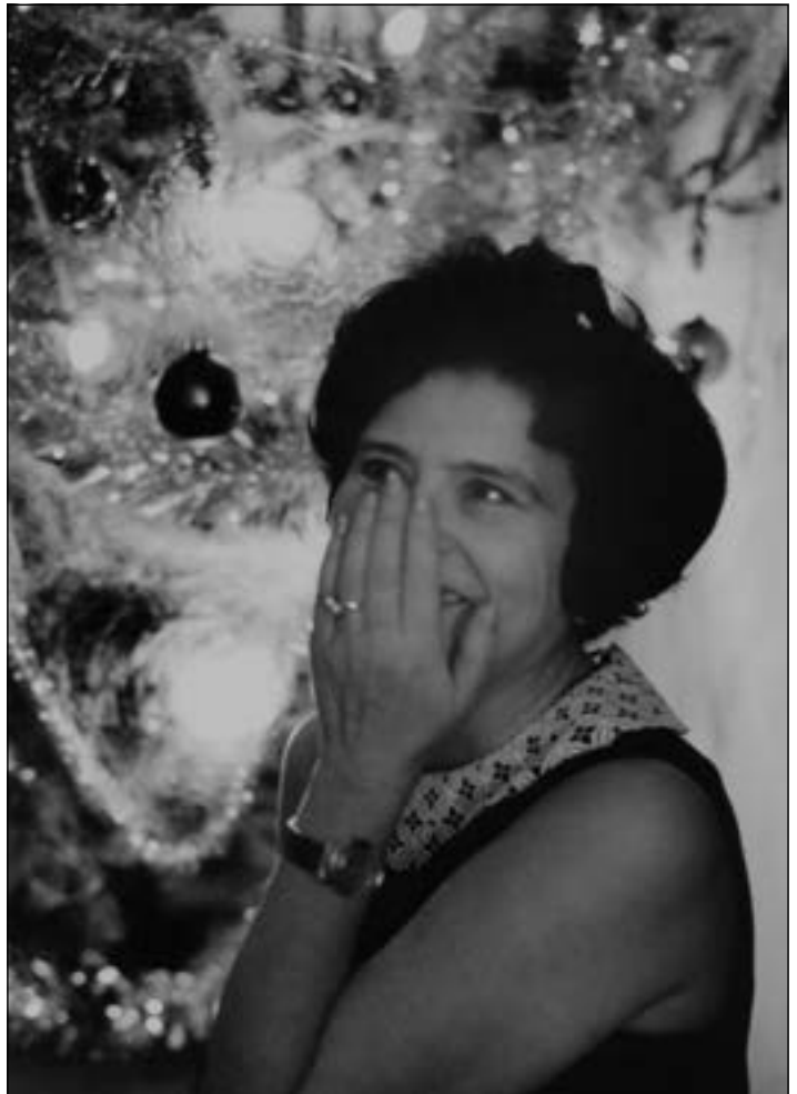
One of my favourite photos of my mom at Christmas, 1966. My dad had just given her a lovely piece of jewelry.