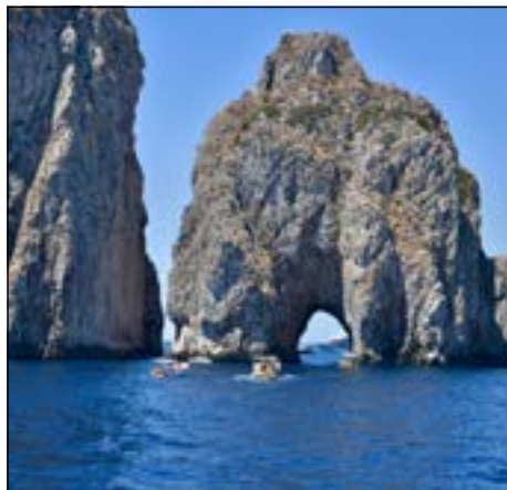
Mackenzie Vance - unsplash