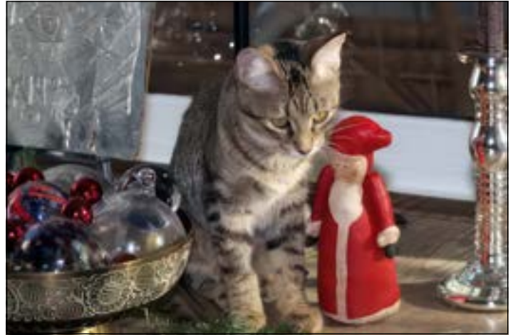
Our daughter's kitten, years ago, contemplating the existential kitten question, "To Knock off, or Not to Knock Off".