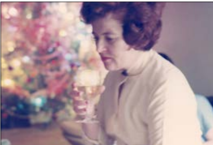
Another of my favourite photos of my mom at Christmas, 1967.