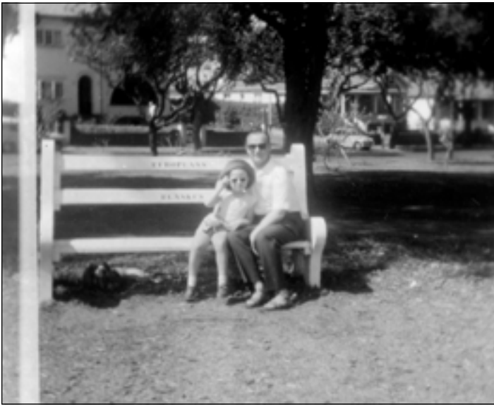
My first Christmas in Durban, South Africa. Note the "Whites Only" sign on the bench. It was the apartheid period.