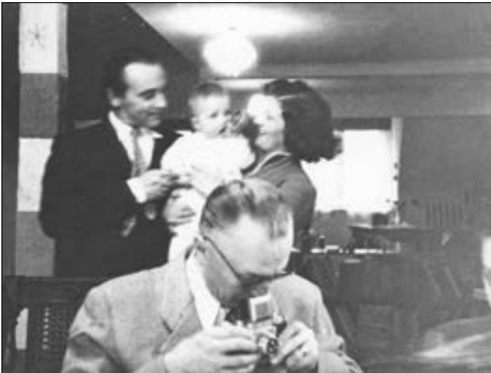
My very first Christmas, 1954, I was six months old.