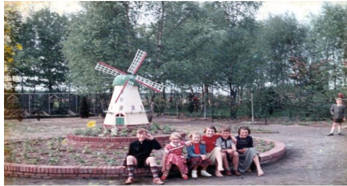
A park in Amsterdam