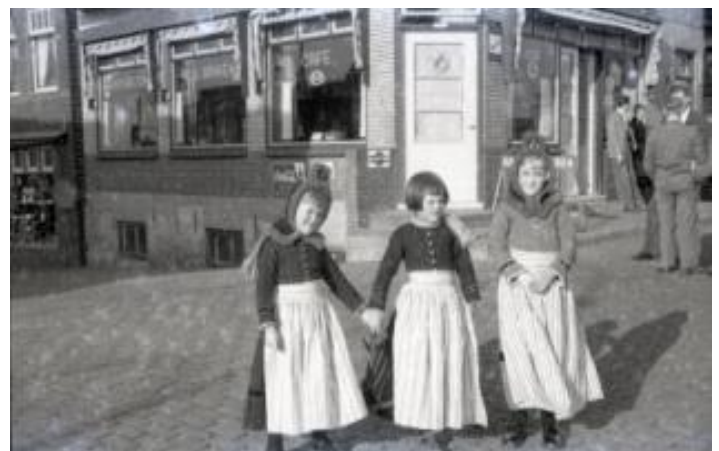
Dutch girls on an evening stroll

I thanked him once again and started for Eindhoven. I wanted to be back before sun set, before it started getting cold. After driving for about half hour, we passed through a village. I saw four adorable girls, hardly 6 to 7 years of age in typical Dutch dress coming out for an evening stroll, they looked very pretty. I asked them to stop for a while, when I took out my camera, they did not object. The little one was very curious. I took their pictures and thanked them. They acknowledged just with a smile.