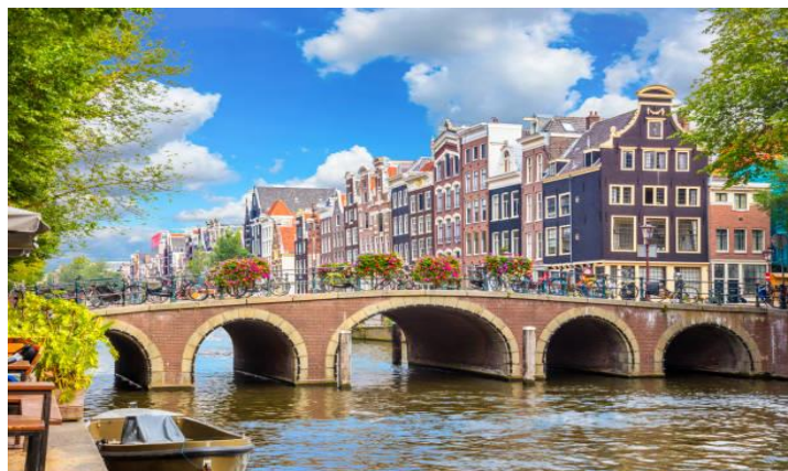
A Canal in Amsterdam

She looked lovely in the afternoon sun, I decided to take her picture and stopped the car on