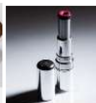
Lipstick Pistol 1965, KGB