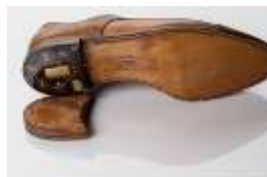
Shoe with Heel Transmitter 1960s, Eastern Europe

Above is the web address for the spy museum in Washington DC. Check it out! It has some interesting items in its collection, some of which are pictured on the right.