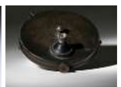
Stirn's Buttonhole Camera 1886, Germany