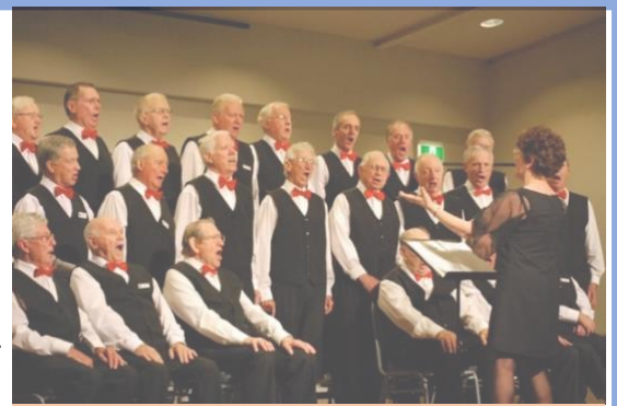
The Choir singing at the Kiama Choir Festival in 2012